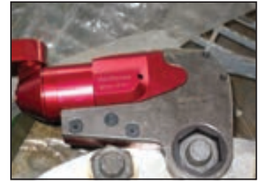
METRIC RATCHET HEAD SELECTION TABLE: