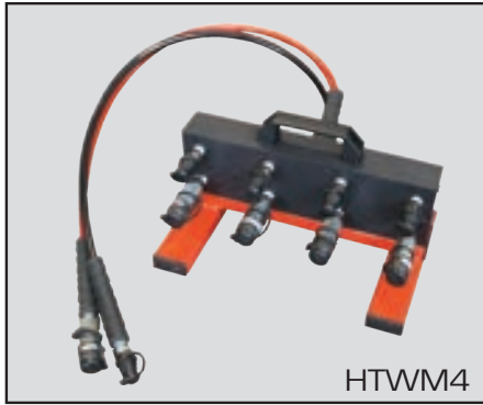
4-WAY MULTI SPLIT BLOCK