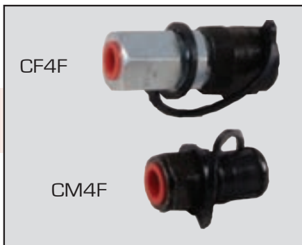
QUICK CONNECT COUPLINGS